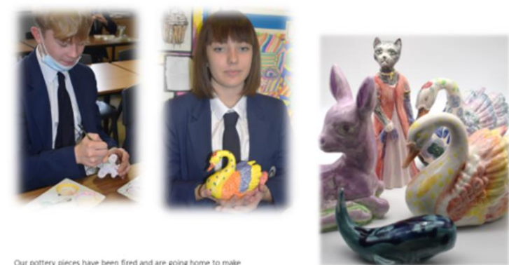
Our pottery pieces have been fired and are going home to make beautiful personal presents. Well done Year 11!

Well done Year 11 - you have been absolutely fantastic during the ceramics enrichment sessions - some very lucky people are about to receive some lovely gifts! #creative #thoughtful #enrichment #empoweringlearnersforlife Shaw Education Trust